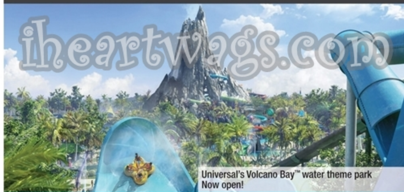
Universal's Volcano Bay™ water theme park Now open!

And over 10,000 available instant prizes with your qualifying purchase of any ONE participating Banana Boat® or Hawaiian Tropic® product (or request a code by mail). While supplies last. Details printed at checkout.