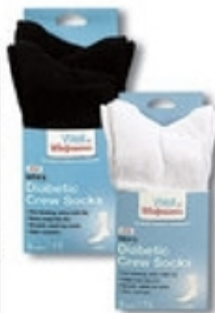
Diabetic Crew Socks

Balance® Rewards 5.99 ea. or 2/$10 1000 POINTS on 2 $1 reward good on next purchase** like paying 2/$9