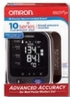
Omron 10 Series Blood Pressure Monitor

coupon savings with card 89 99 less coupon online or in store* $15 final cost 74 99